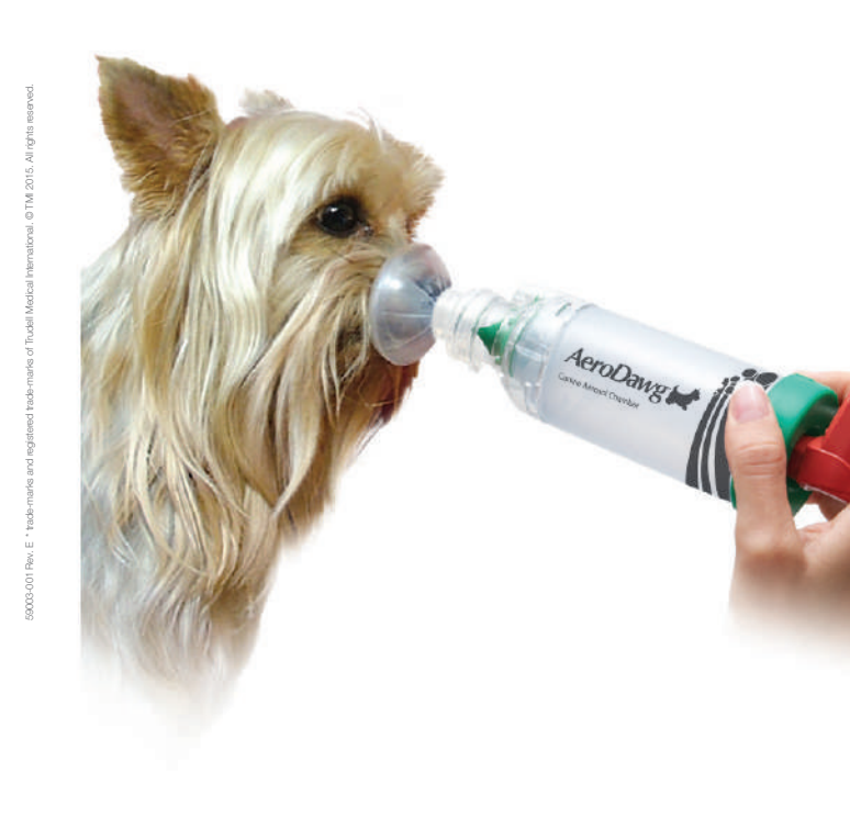
Trudell Medical International www.aerodawg.co.uk

Does your dog suffer from respiratory symptoms?